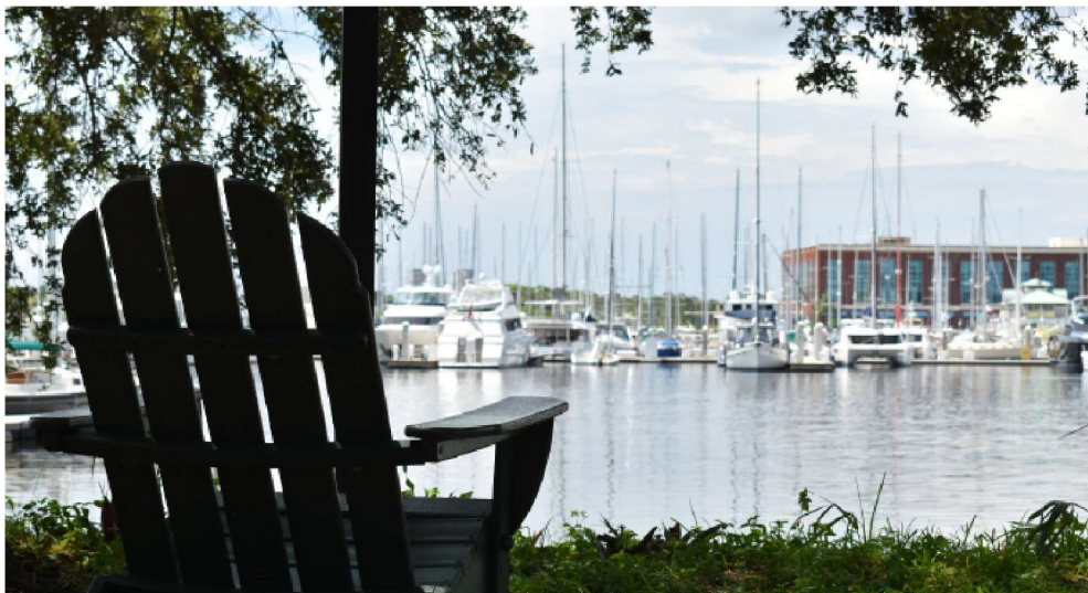
MOLLY RYAN | THE CROW'S NEST

Take in the stunning views that downtown St. Petersburg offers and relax from your busy day of classes at the harbor. USF St. Petersburg offers benches and prime waterfront views. If you are lucky enough, you might even see some marine wildlife.